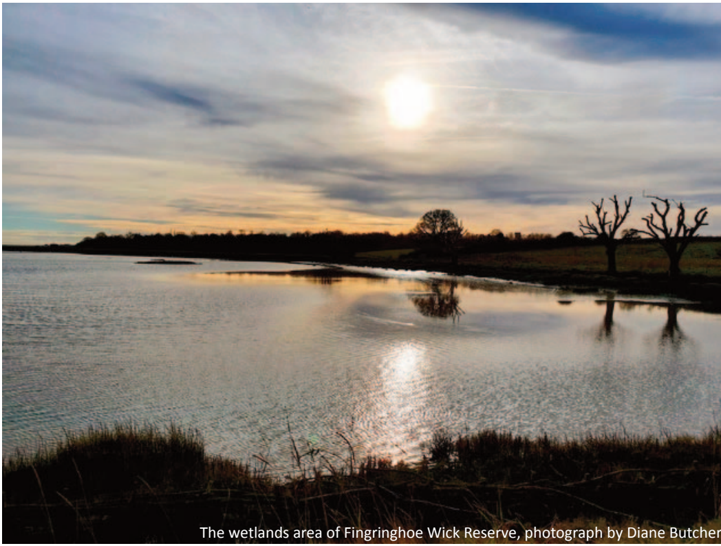
The wetlands area of Fingringhoe Wick Reserve