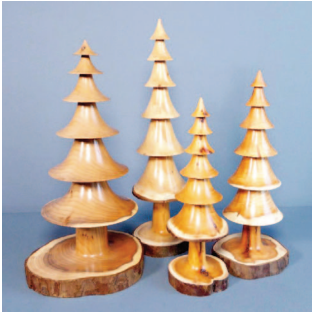
Nicholas Rowe, Trees (yew wood)