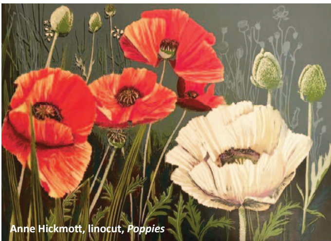
Anne Hickmott, linocut, Poppies

Geedon Gallery Jaggers, Fingringhoe CO5 7DN 01206 729 334 / 728 587/ 07901 918 046 jataber@aol.com www.geedongallery.co.uk