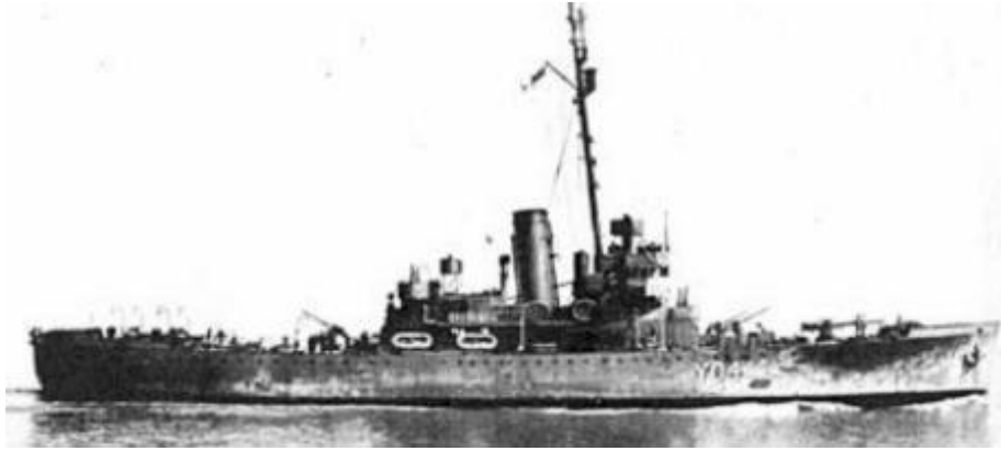
The HMS Walney (USCG Sebago)